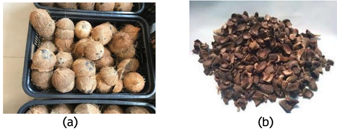
Figure 1.2: Raw material of (a) coconut shell and (b) palm shell

Once the raw materials are free from any dirt, coconut shells and palm shells are sun dry to remove moisture. The next stage of producing briquette charcoal is called the carbonization process. The formation of briquette charcoal is black and composed of carbon. It also indicates the amount of charcoal obtained as the carbonization temperature increases, the lagging mass starts to decrease.