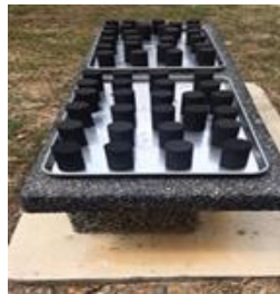
Figure 1.3: Drying process of briquette

In this state, the briquette charcoal was ready for sun dry for 21 days from the moulding day. The briquette charcoal must be moisture free totally. The briquette then kept in the dry state. Figure 1.3 shows the drying process of briquette.